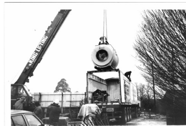
Figure 5 The scanner being delivered in 1987

In 1992 a second scanner was put into the MRI centre by the Bristol MRI Scanner Fund and an MRI scanner was purchased and installed at the BRI by UBHT with some staffing costs